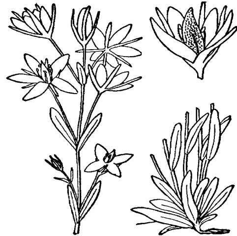
Illustration from Britton & Brown's Illustrated Flora of the Northern United States and Canada, 2nd ed.

Aids to Identification: Marsh felwort grows about 10-20 cm tall, with stiffly ascending branches, and has fleshy narrow leaves, about 2-3 cm long, borne opposite each other on the stem. Its 4-5 petalled blue flowers are up to 3 cm in diameter. Its flowers are unusual in that the stigmas are not borne on a style, but rather from 3 lines on the ovary.